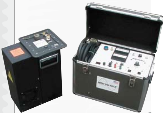
Two-piece easy portability

This model, with its 44 kVac peak output, is suitable for testing cables rated up to 25 kV. Its high load capacity enables it to test up to over 10 miles (16 km) of cable, depending on type. This model includes a charging current and load capacitance meter, and a center zero peak kilovolt output meter. The two piece construction permits the VLF-4022CM to be more easily transported and stored than others.