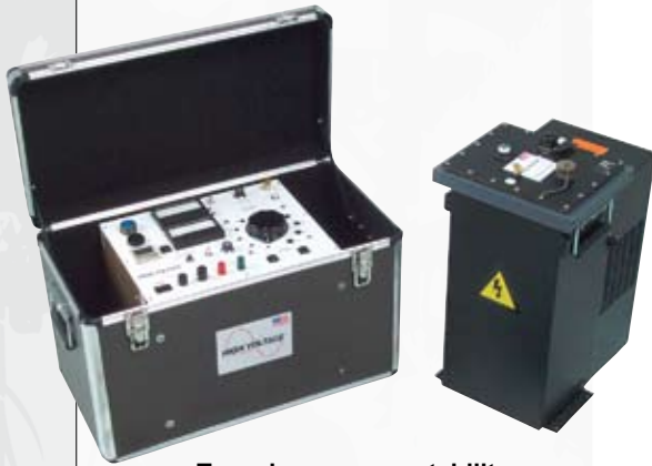
Two-piece easy portability

This model, with its 60-62* kVac peak output, is suitable for testing cables rated up to 35 kV. Its high load capacity enables it to test up to over 15 miles (24 km) of cable, depending on type. This model includes an enhanced features package: a charging current and load capacitance meter, test dwell timer, and polarity indicating lights. The two piece construction permits the VLF-6022CM to be more easily transported and stored than others.